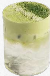
MATCHA CLOUD ..... 70. Hydration maxed up with coconut water