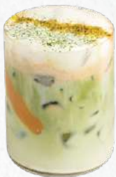
PINATSU MATCHA ..... 65. Power up your matcha latte with peanut butter