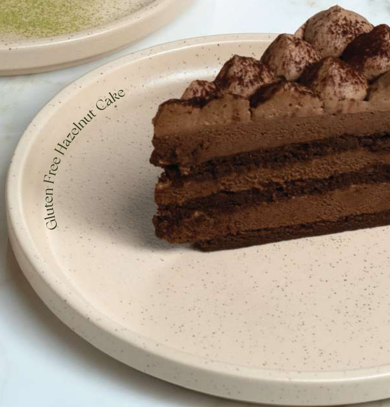
Gluten Free Hazelnut Cake