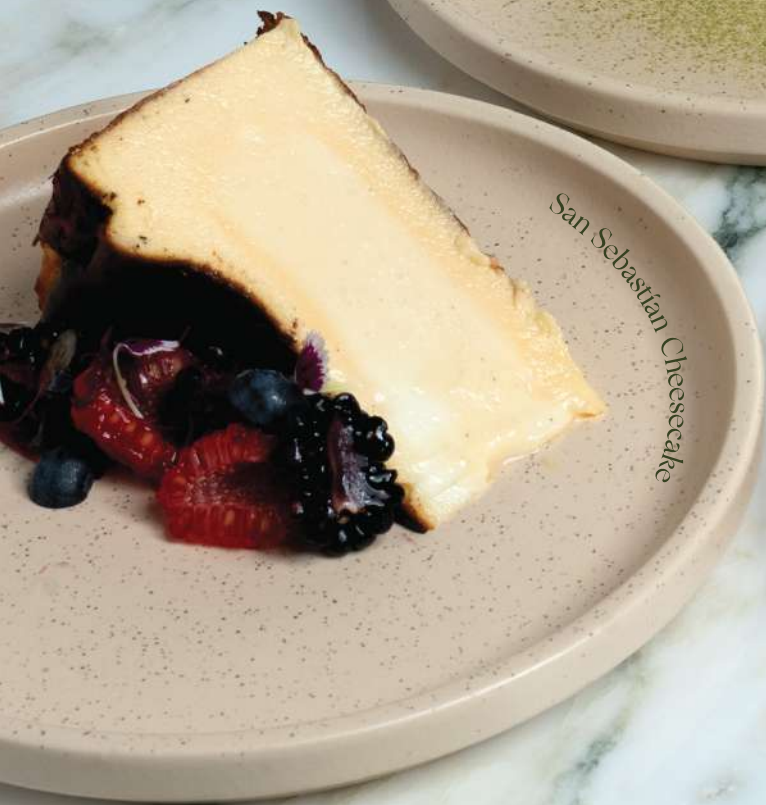
San Sebastian Cheesecake