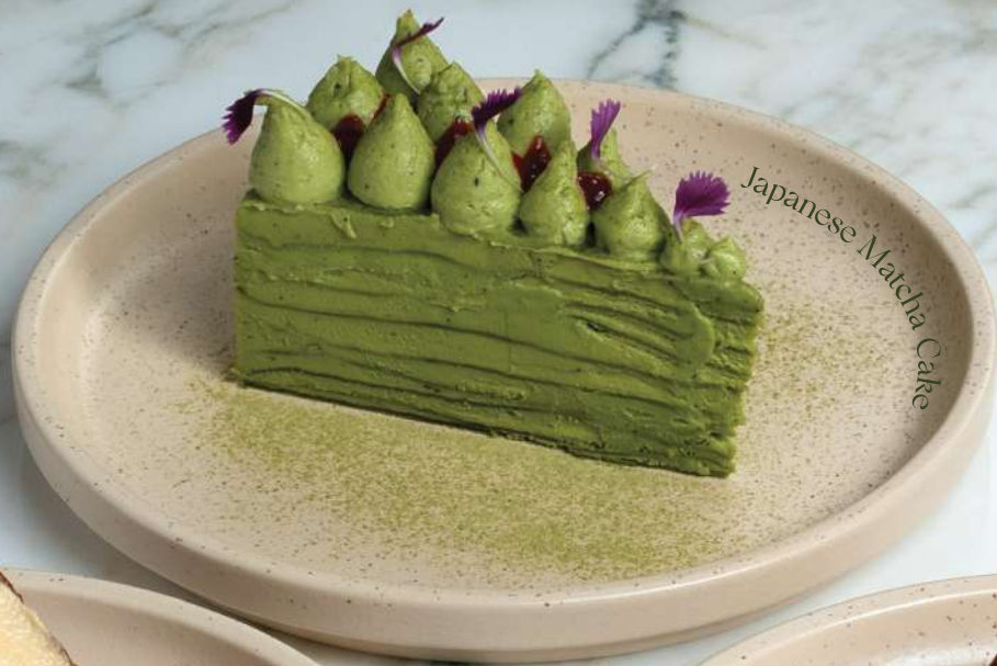
Japanese Matcha Cake