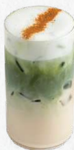
MATCHA CHAI ..... 80. For the revitalizing flavor combo of cloves, cinnamon, cardamom & fresh milk