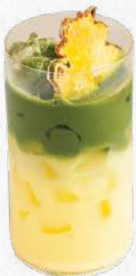
PAINAPPURU MATCHA ..... 60. Refresh on the tropical blend of fresh pineapple juice & coconut milk