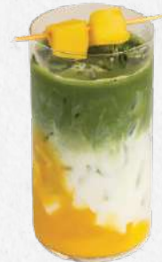
TROPICAL MANGO MATCHA .... 65. Refreshing & sweet on fresh mango puree & coconut milk