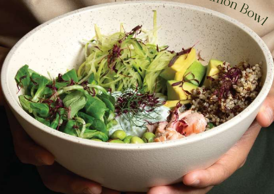
M16 Poached Salmon Bowl