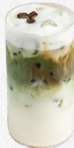
DIRTY MATCHA LATTE .... 75. To give it the real espresso kick